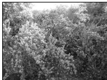
Texas Ranger: eucophyllum frutescens , "Green Cloud" currently in magnificent color at the Garden.

Clovis Botanical Garden Clovis, California Located on Clovis Avenue just North of Alluvial. www.clovisbotanicalgarden.org