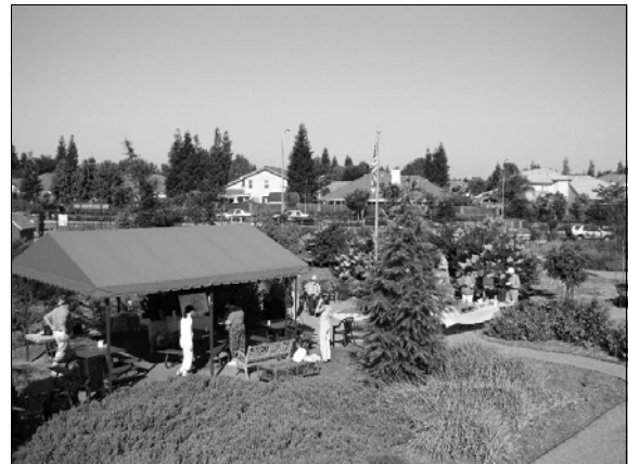
June 2006 Member/Volunteer breakfast held at the Garden

Come to the Garden and see for yourself! The weather is cooler and we'd love to have you visit.