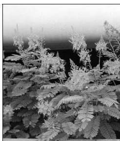
Red Bird of Paradise (Caesalpinia pulcherrima)

Clovis Botanical Garden Clovis, California Located on Clovis Avenue just North of Alluvial. www.clovisbotanicalgarden.org